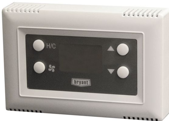
Fig. 1 - Legacy Line-RNC Series Programmable Thermostat