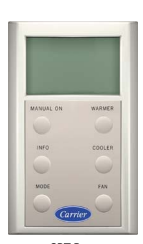
SPT Pro+ part# SPPF