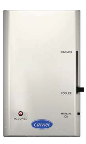
SPT Plus part# SPPL