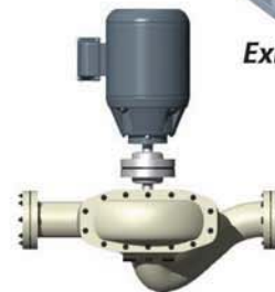
Water Loop Control